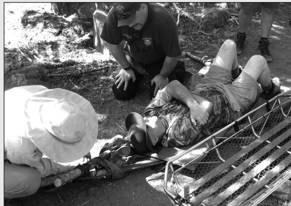
The patient discussed his symptoms with EMT before being transferred from the homemade emergency lifter to one the EMT team brought with them.

an emergency phone call. The rest of us constructed a crude lifter to carry the man. Several people carried the stretcher while others carried the equipment. We traveled about two miles before we were met from below by a team of emergency responders. They reviewed the patient's condition and transferred him onto a better stretcher that they had brought. The patient was transported the remaining mile to the parking lot and into an ambulance. We were surprised to discover that perhaps two dozen emergency people had responded and were in the parking lot with a large number of vehicles.