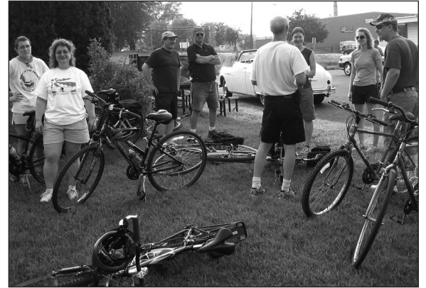
Many enjoyed a May 25th bike ride on the Wiouwash Trail with a pit-stop at Charlie's Place in Hortonville for burgers and malts.