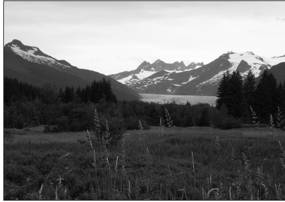
Mendenhall Glacier and Meadow in Juneau, Alaska.

are lucky to have such beautiful National Parks and Glacier Bay is a real gem. I firmly believe that people need wild places to recharge their emotional lives and reconnect with nature. I was initially afraid my 18 year old daughter would not find it as interesting as I but she was thrilled with the beauty as well. We saw three tidewater glaciers that day including the large Johns Hopkins Glacier. These glaciers may not be there when my daughter is my age and I'm glad we had the opportunity to see them.